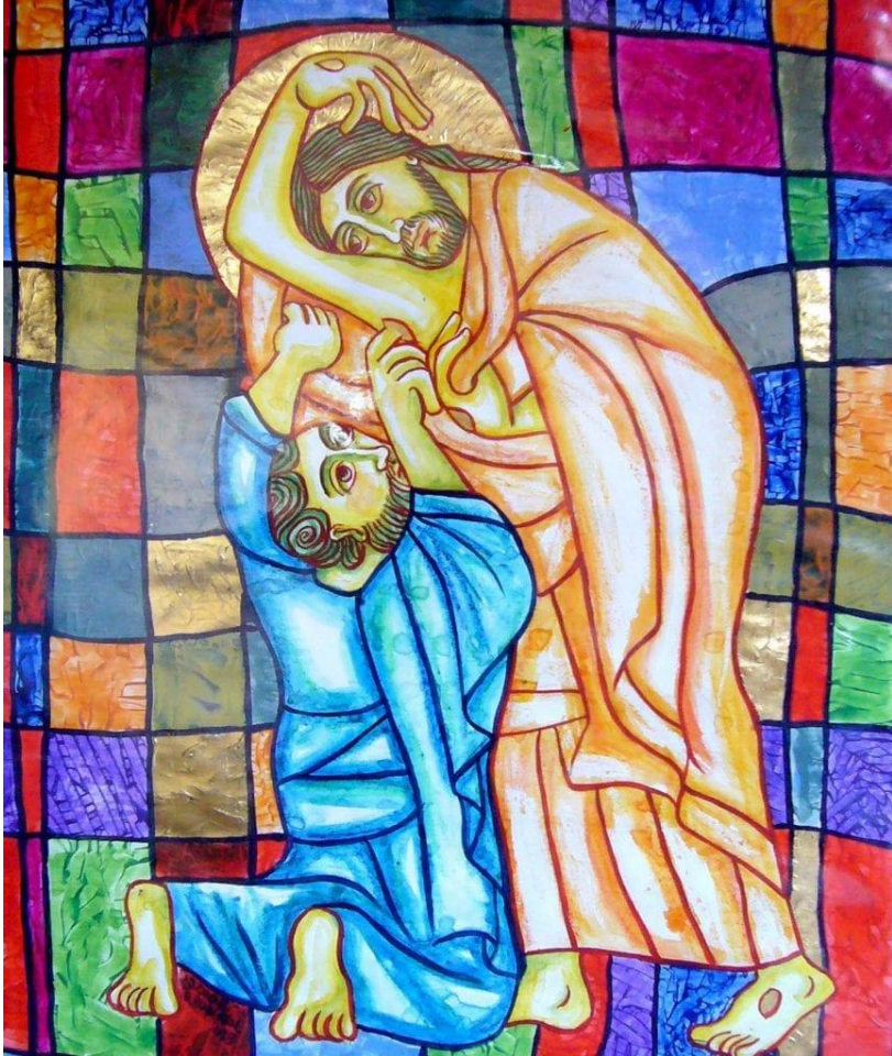
Thomas & Jesus window, Sacred Heart Church, Horseferry Road, London