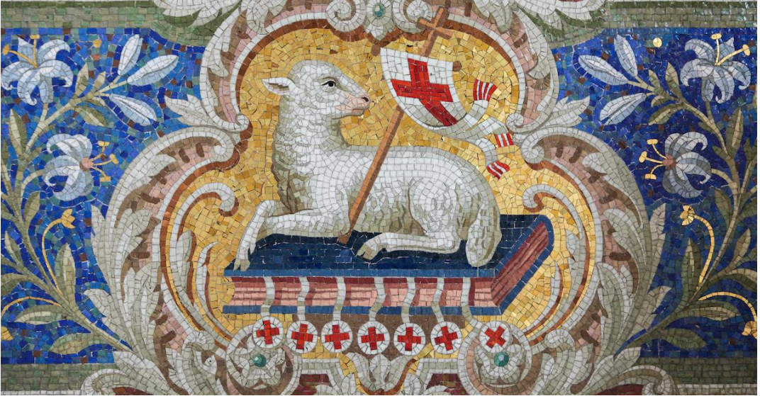
Lamb of God (Agnus Dei) mosaic in the Martini church in Braunschweig, Niedersachsen, Germany.