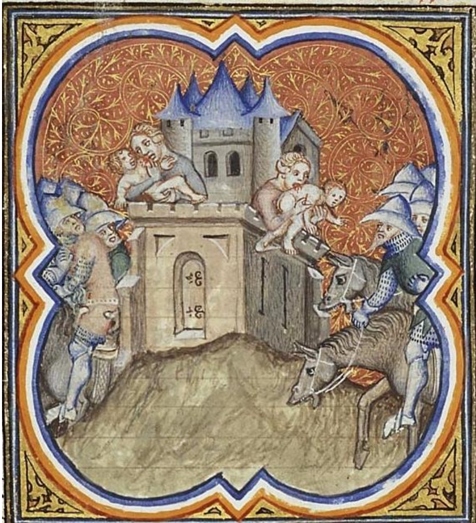
Nebuchadnezzar camp outside Jerusalem; Famine in the city, 1372 version of Petrus Comestor's "Bible Historiale" (manuscript Den Haag, MMW, 10 B 23).