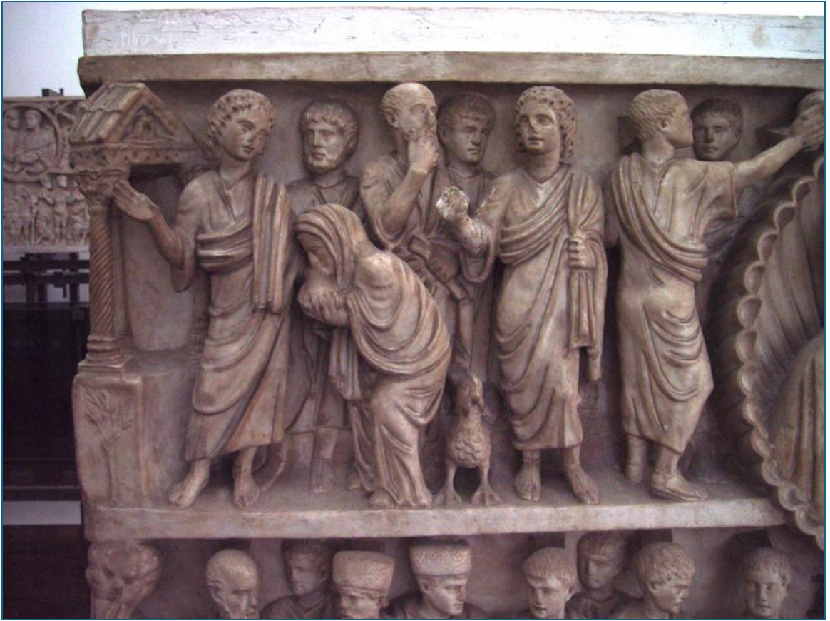
Christ healing the crippled woman who was bent over, from Art in the Christian Tradition, a project of the Vanderbilt Divinity Library, Nashville, TN. Known as the Two Brothers Sarcophagus. The cock of St. Peter is depicting below Christ's feet. Both Christ and Moses are clean-shaven. Date: 4th century.