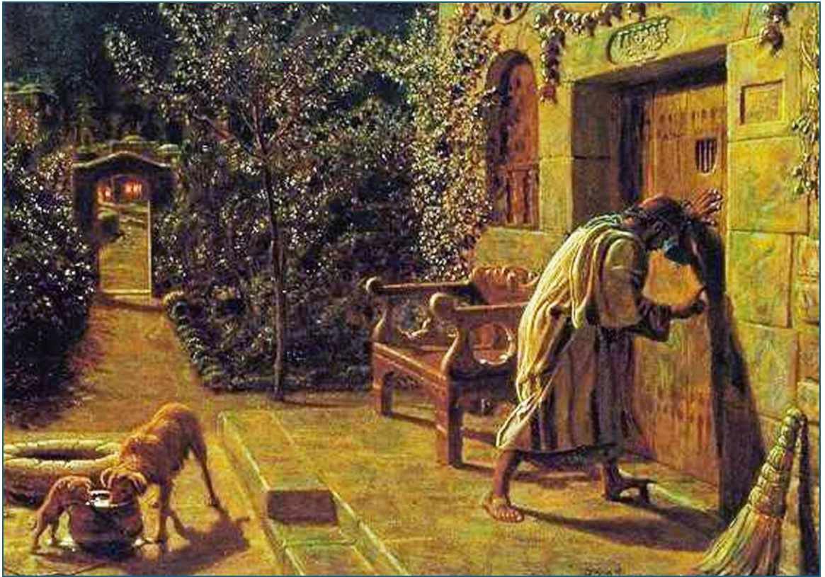
The Importunate Neighbour, 1895, oil on canvas, by William Holman Hunt, National Gallery of Victoria.