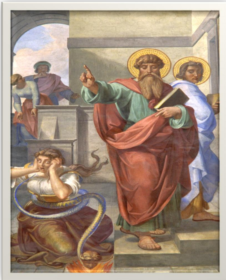
"The Exorcism of the Slave Girl," Luigi Cochetti, ca. 1857, oil on canvas, the Basilica of St. Paul Outside the Walls in Rome.