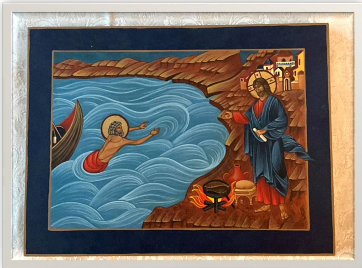
Peter and Jesus on the Shore with Breakfast, handpainted icon, 2021, private collection