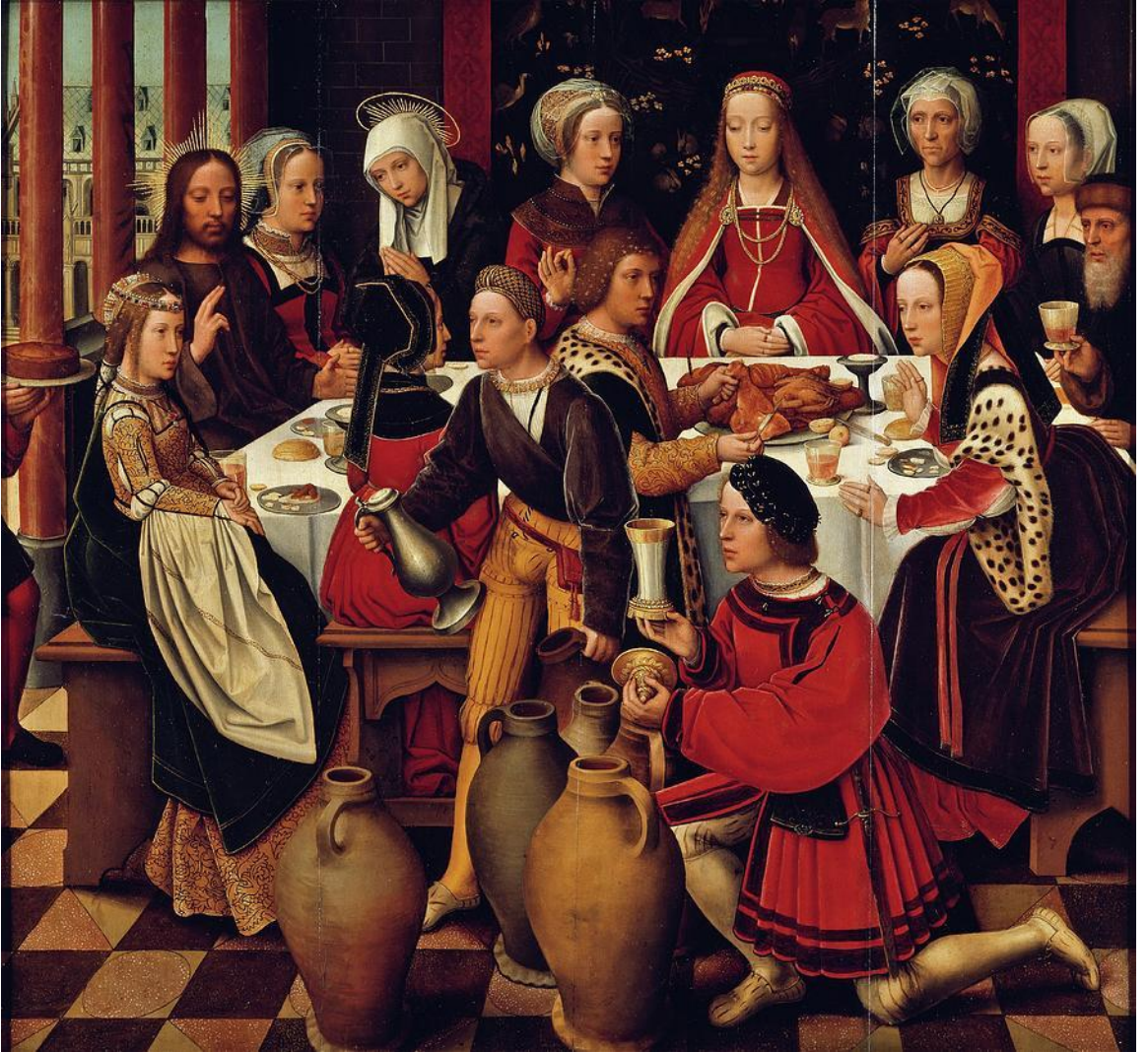
The Wedding at Cana, oil on oak panel, Ambrosius Benson or the Master of Segovia, about 1540 AD.