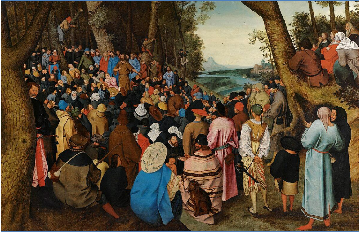
The Sermon of Saint John the Baptist, oil on oak wood, app. 1600 AD, Pieter Brueghel the Younger.